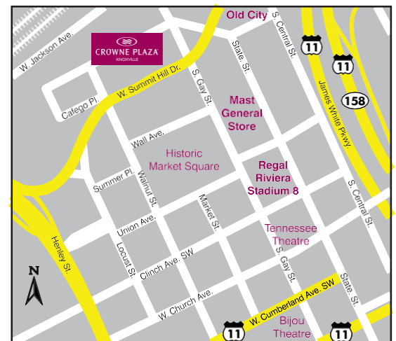
From I-40/75 take the James White Parkway exit #388A to Summit Hill Drive and turn right. The Crowne Plaza is three blocks on the right.